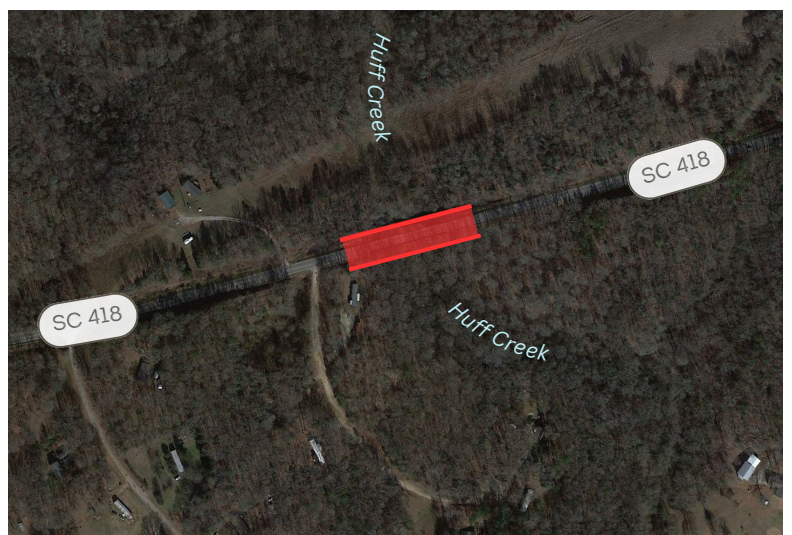
SC 418 (OLD HUNDRED RD) OVER HUFF CREEK

SCDOT proposes bridge repair, rehabilitation, and preservation activities for several statewide bridge maintenance projects. The purpose of this project is to reduce the number of load restricted bridges by performing comprehensive and cost effective bridge repairs. These repairs are part of SCDOT's Statewide Closed and Load Restricted Bridge Repair Program. The proposed repairs will improve mobility in the region and extend the service life of the bridge.