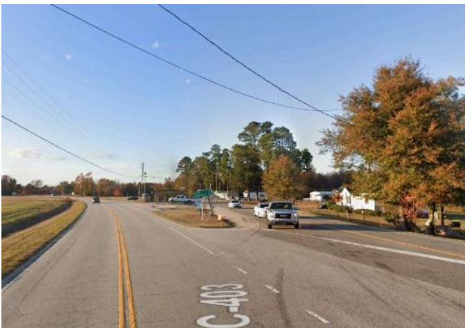
Olanta Highway at North Bethel Road

Date: November 19, 2024 Time: 5:00 PM – 7:00 PM Location: Camp Branch Pentecostal Holiness Church 165 North Bethel Road Scranton, SC 29591