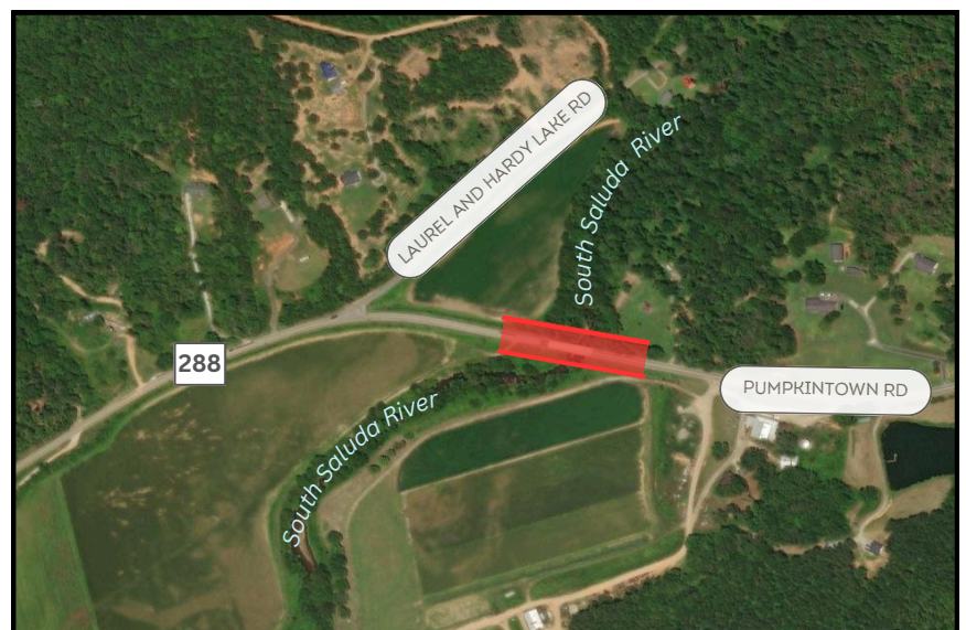
SC 288 (PUMPKINTOWN RD) OVER SOUTH SALUDA RIVER

SCDOT proposes bridge repair, rehabilitation, and preservation activities for several statewide bridge maintenance projects. The purpose of this project is to reduce the number of load restricted bridges by performing comprehensive and cost effective bridge repairs. These repairs are part of SCDOT's Statewide Closed and Load Restricted Bridge Repair Program. The proposed repairs will improve mobility in the region and extend the service life of the bridges.