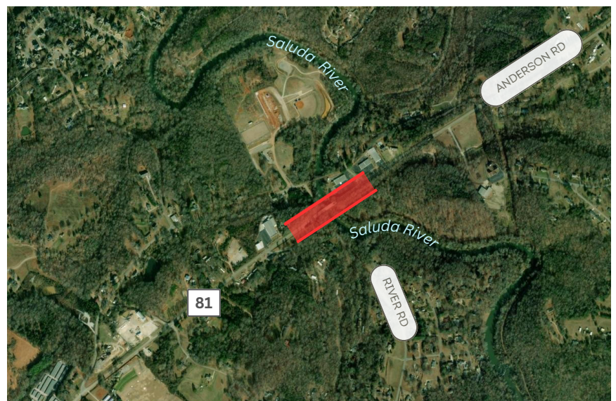
SC 81 (ANDERSON RD) OVER SALUDA RIVER

SCDOT proposes bridge repair, rehabilitation, and preservation activities for several statewide bridge maintenance projects. The purpose of this project is to reduce the number of load restricted bridges by performing comprehensive and cost effective bridge repairs. These repairs are part of SCDOT's Statewide Closed and Load Restricted Bridge Repair Program. The proposed repairs will improve mobility in the region and extend the service life of the bridges.